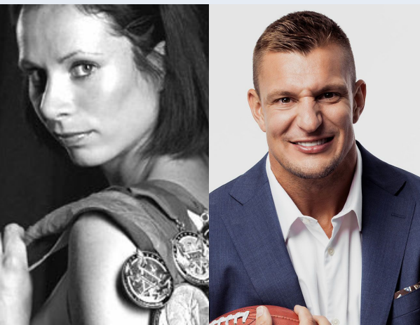
Rob Gronkowski Class of 2024